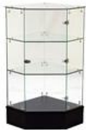
Frameless Locking Pentagon Corner FIX-SHW/245338