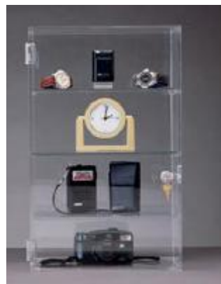
Counter Top Acrylic Showcases with Lock 4 Shelf 10"w x 15"h x 5"d