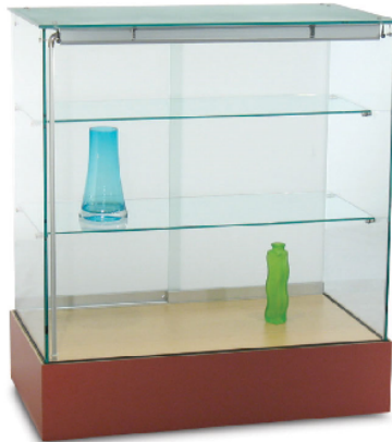
Full Vision Counter Showcase FIX-SHW/245560