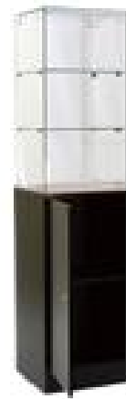
Tower with Storage FIX-SHW/245566