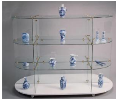
54" Oval Gondola Display 54"Lx 30"W Oval glass gondola display with black base.