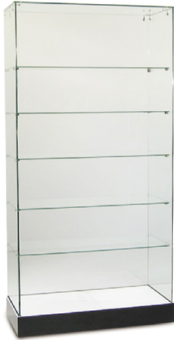
Frameless Showcase Tower FIX-SHW/245572 30" FIX-SHW/245568 48"

FULL VISION SHOWCASES Give your décor a touch of elegance and class while providing the ideal setting for displaying your product.