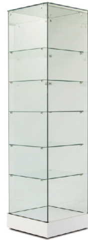
Tower Full FIX-SHW/245575

These showcases are sold by special order only. A deposit may be required at time of ordering.