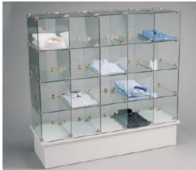
Glass Cube Unit

All glass cube units shipped unassembled by common carrier or truck, whichever is most economical. We can price out any size glass cube unit, for details please call us.