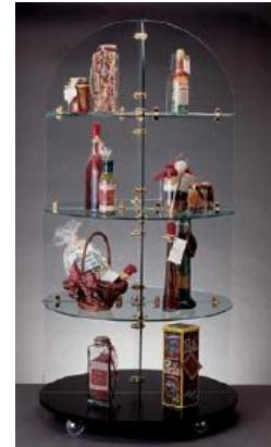
30" Revolving Pedestal 30" Round frameless revolving glass display with black base